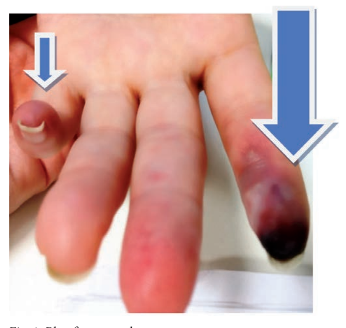
Fig. 1: Blue finger syndrome

Case report: A 41-year-old female was admitted to our outpatient department with a painful acute bluish discoloration of her left thumb and left little finger (Fig.1). She did not have any similar episodes in the past.